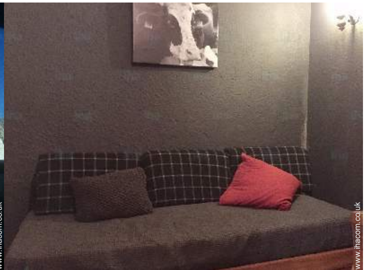
divan 1 pers