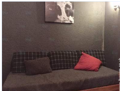
divan 1 pers