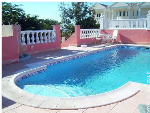
Inside swimming pool