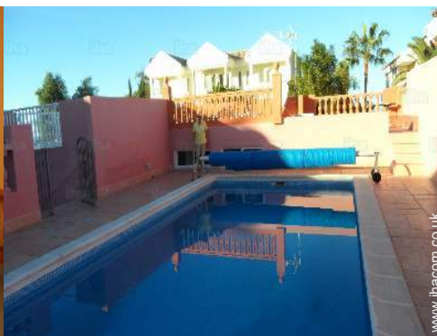
view from the swimming pool