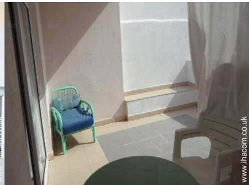
view from the terrace