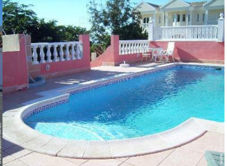
Inside swimming pool