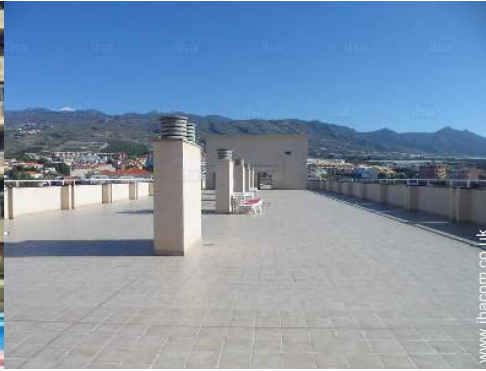
view from the terrace