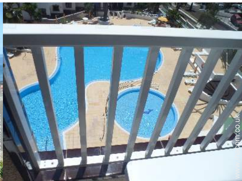
view from the terrace