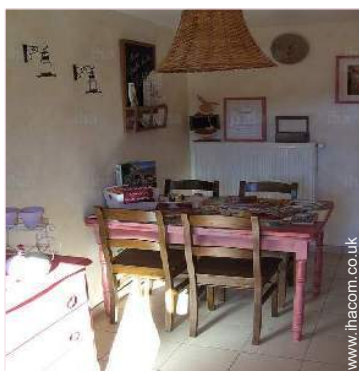
Interior layout at guests disposal