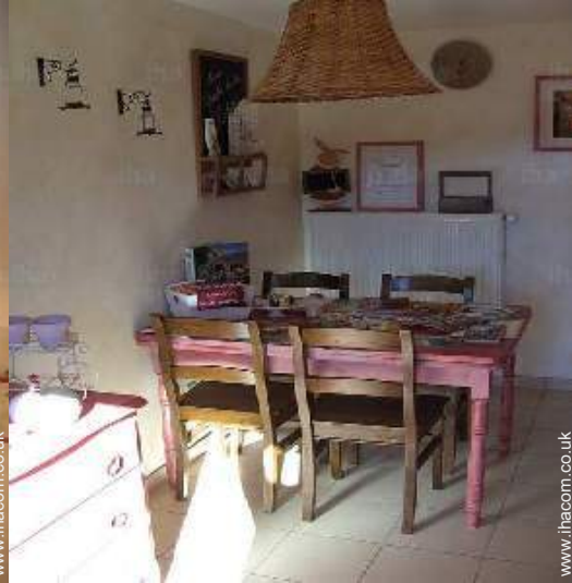
Interior layout at guests disposal