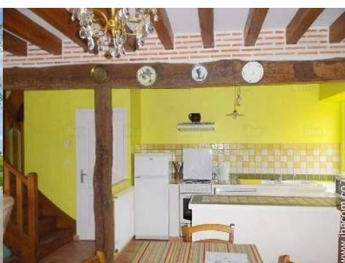
american style kitchen