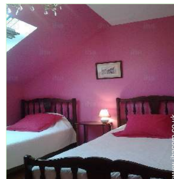
Sleeps - bed(s)

Nursery Village centre 1.25mi. Town centre 9mi. Bus stop / bus station 1.25mi. Tramway system 4.5mi. Bike/mountain bike hire 4.5mi. Car rental 9mi. Breadshop 0.93mi. Caterer 4.5mi. Supermarket 4.5mi. Hairdressing salon 1.25mi. Post office 1.25mi. Bank 4.5mi. Cash point 4.5mi. Chemist 4.5mi. Doctor 1.25mi. Nurse 4.5mi. Hospital 12.5mi.