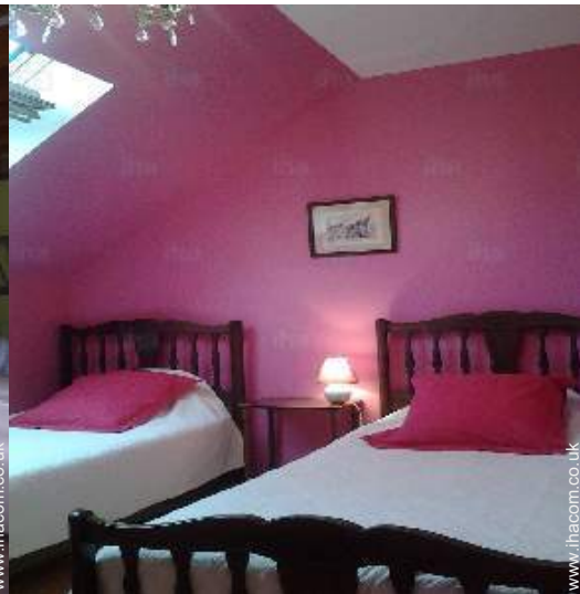
Sleeps - bed(s)