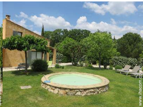
Round swimming pool