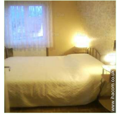
twin beds (standard)