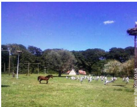
park and garden