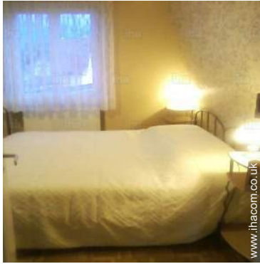
twin beds (standard)