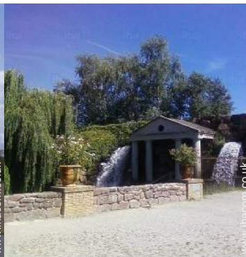
Attractions and relaxation