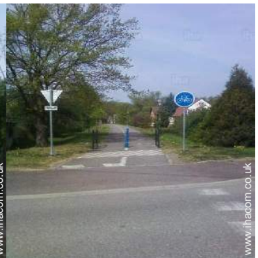
mountain bike (path)