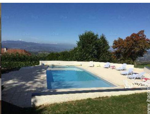
Heated swimming pool