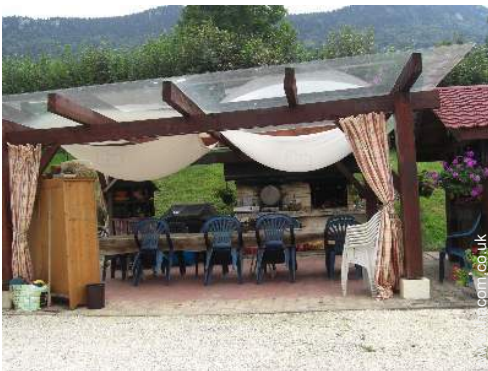
view from the flat