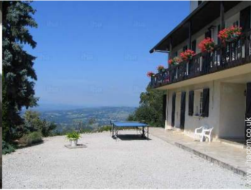
view from the flat