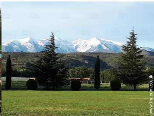
view over the mountain