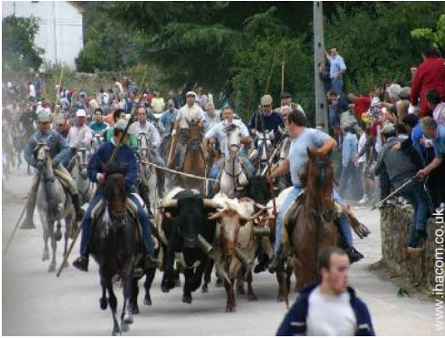
summer sports nearby