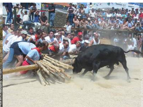
summer sports nearby