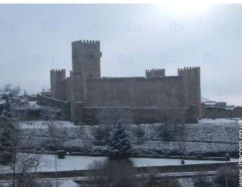
leisure pursuits nearby