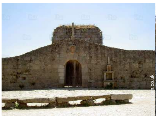
leisure pursuits nearby