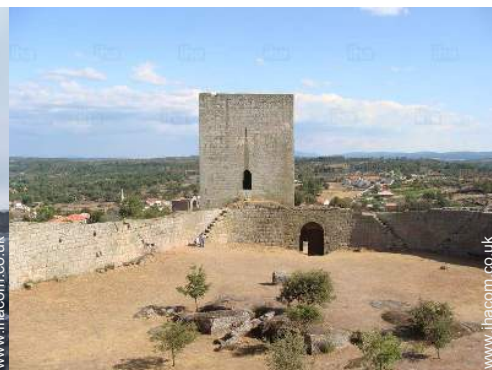
leisure pursuits nearby