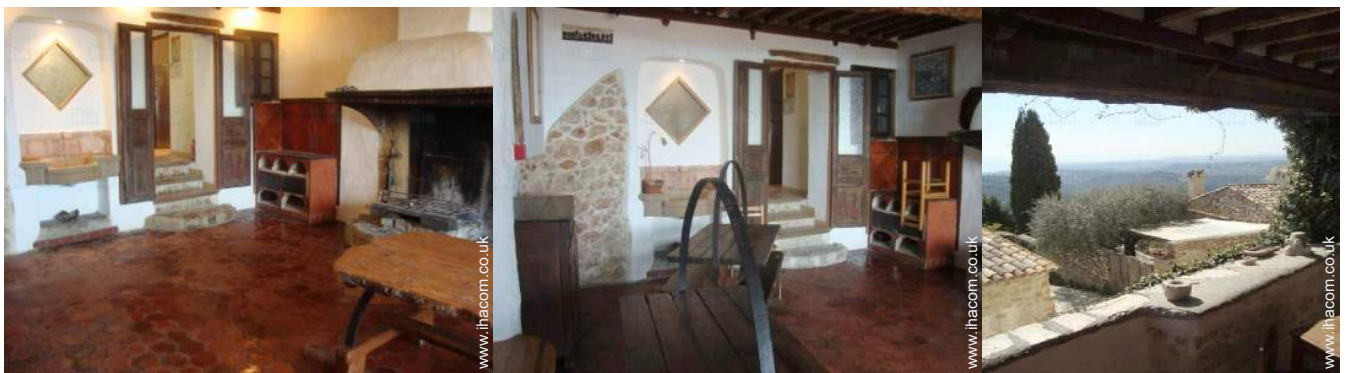
view from the flat