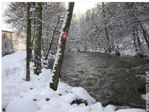
view over the river