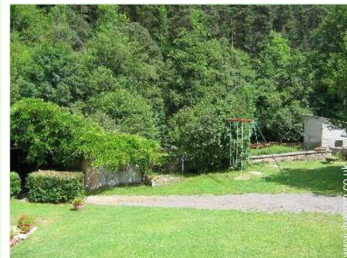
view from the bedroom