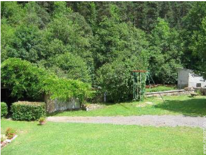
view from the bedroom