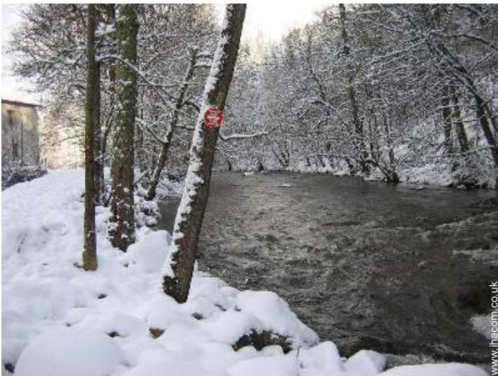
view over the river