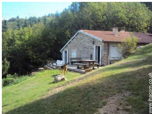
Outside at the guests disposal