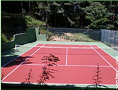
Facilities exclusive to