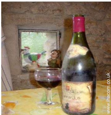
cellar and wine tasting