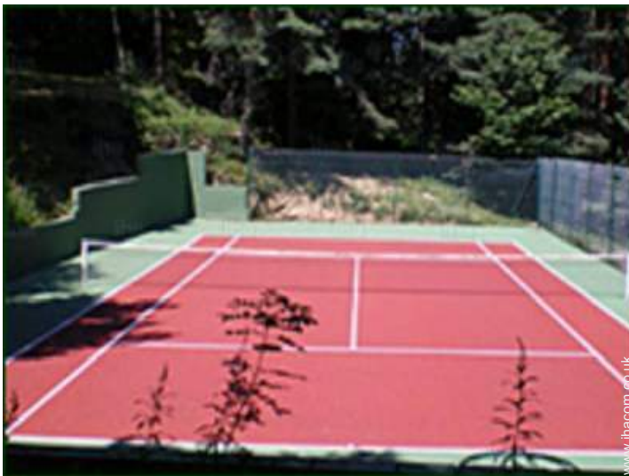
Facilities exclusive to