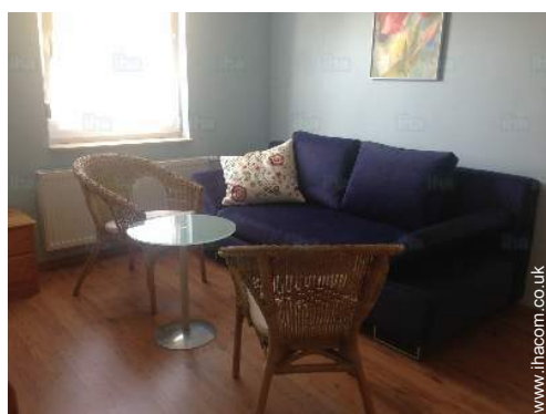
sofa bed(s) 2 pers