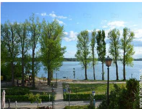
Towns close by