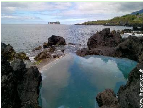
Sea water swimming pool