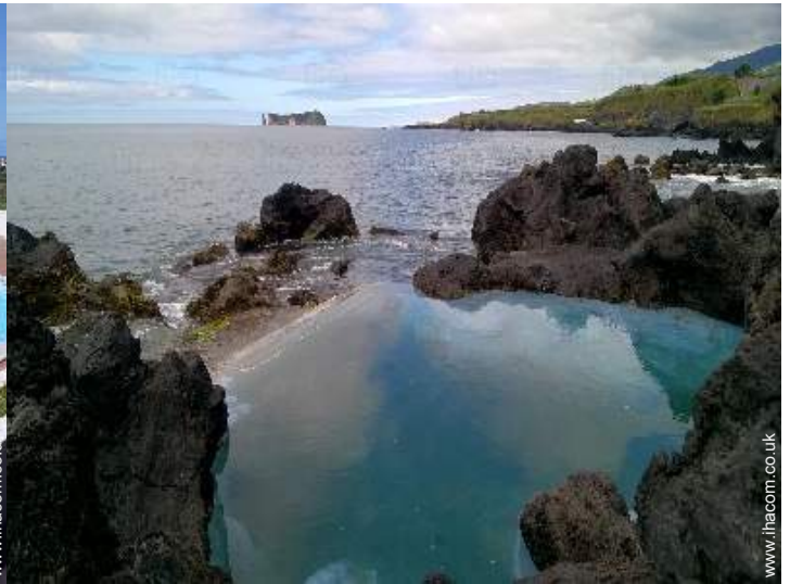
Sea water swimming pool