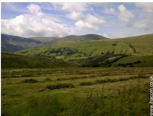
view over the countryside