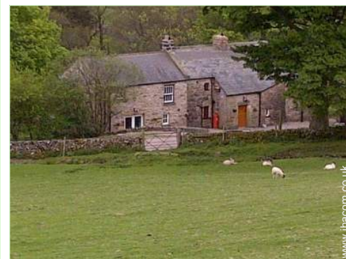
view over farmland

Bank 6mi. Cash point 6mi. Chemist 6mi. Doctor 6mi. Hospital 18.5mi. Dispensing clinic 6mi.