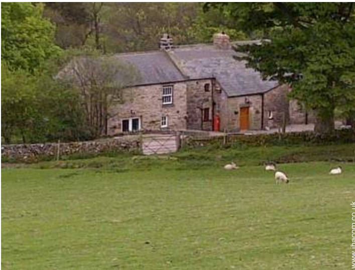
view over farmland