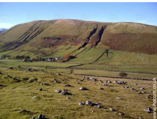
view over the countryside