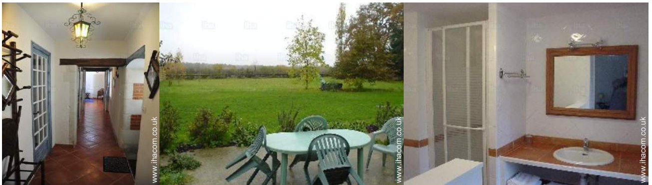
Interior layout and facilities