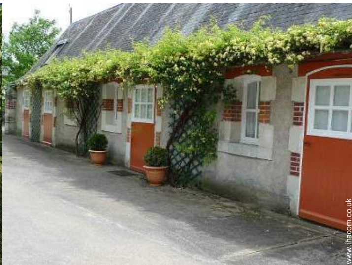
Charming Stone-Built House