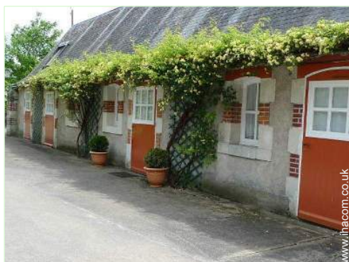
Charming Stone-Built House