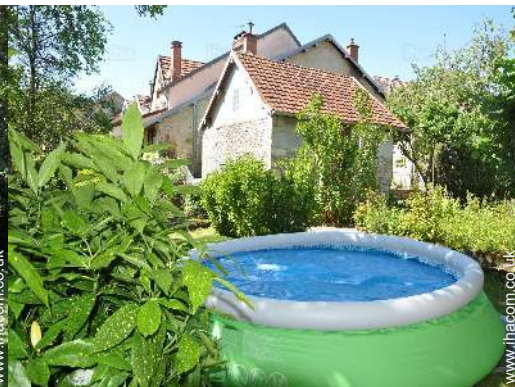
Exterior amenities at guests disposal