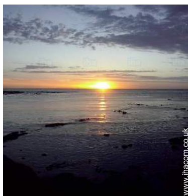
view over the ocean