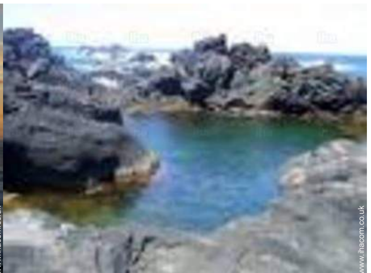
natural spring baths