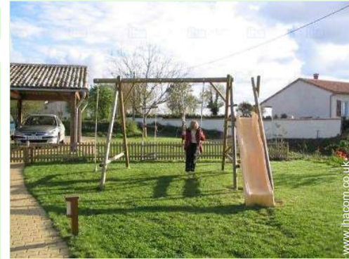
view from the kitchen