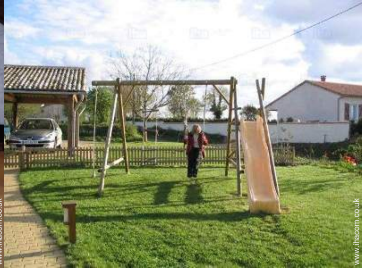
view from the kitchen