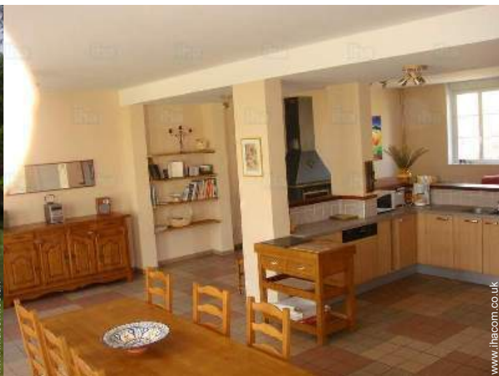
american style kitchen