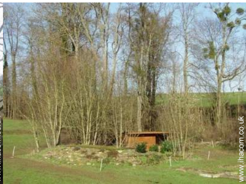
view from the sitting-room