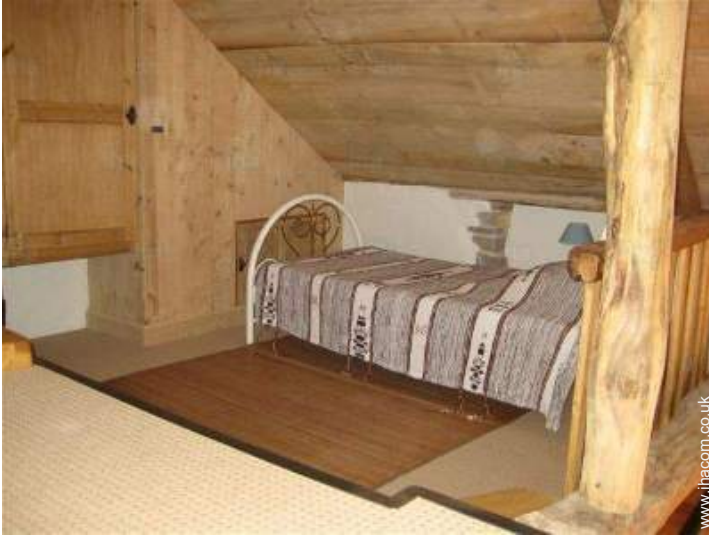
view from the mezzanine