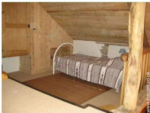
view from the mezzanine