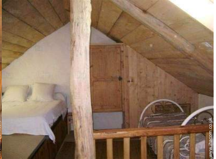
view from the mezzanine