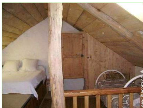
view from the mezzanine