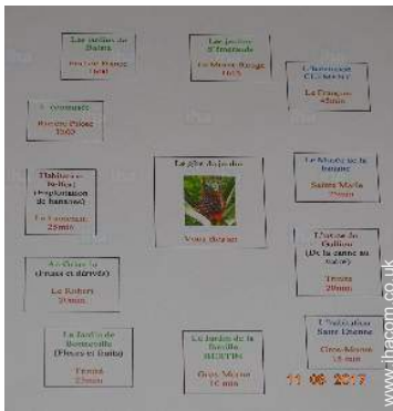
park and garden