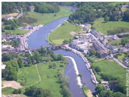
view over the river