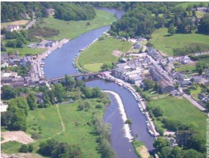
view over the river