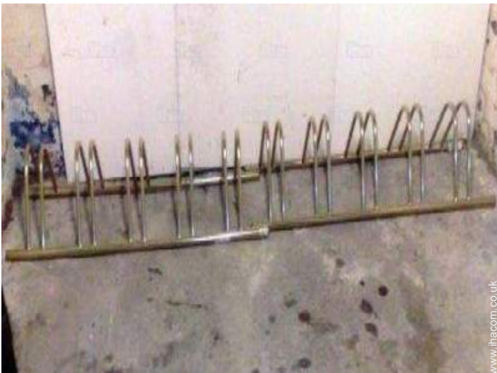
Equipment at the guest's disposal