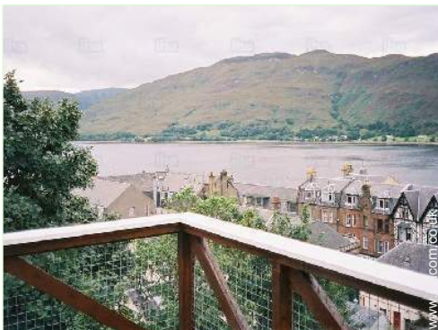
view from the balcony