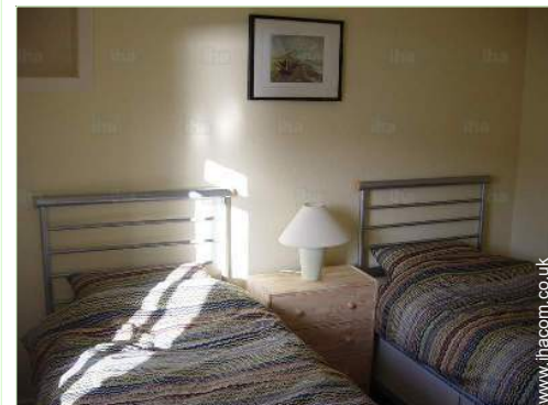
twin beds (standard)