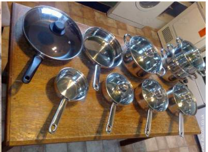
Equipment at the guest's disposal