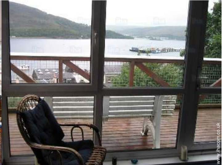
view from the sitting-room