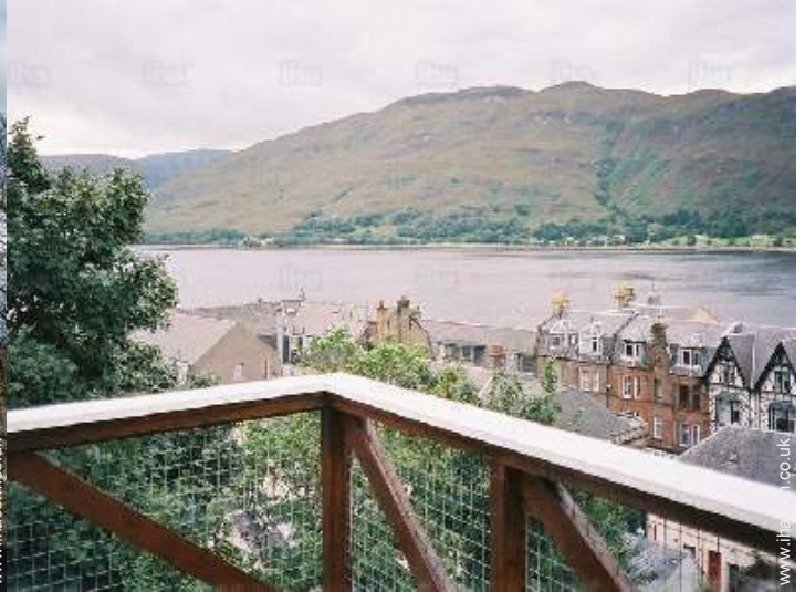
view from the balcony