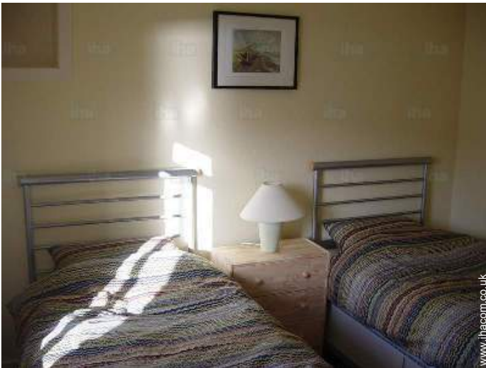
twin beds (standard)