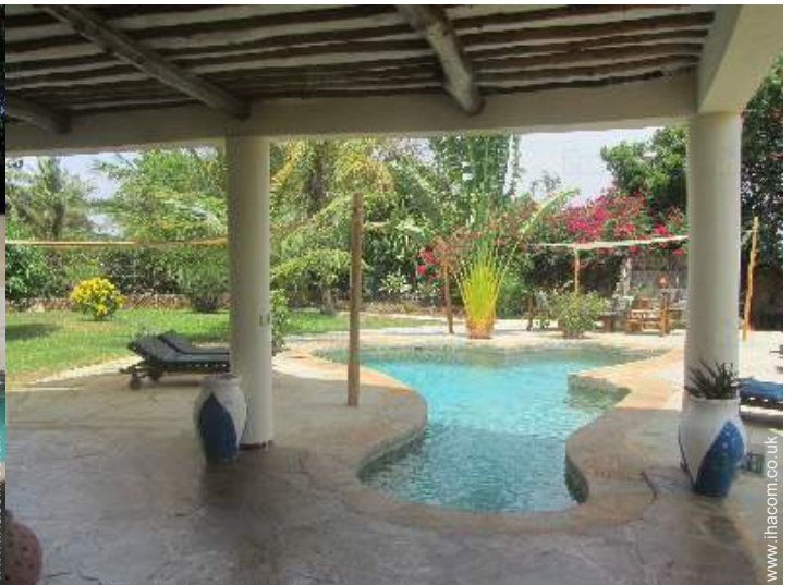
view from the swimming pool