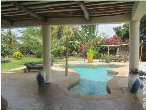
view from the swimming pool