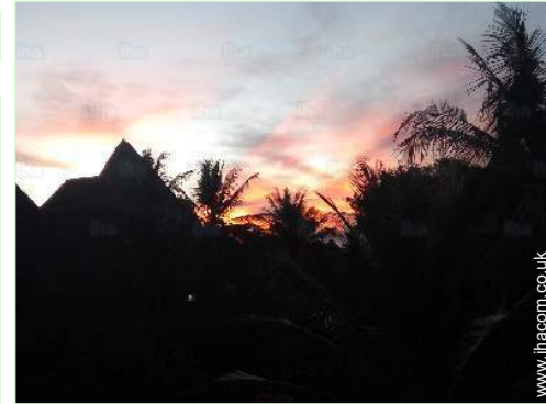
view from the covered terrace