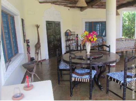
view from the covered terrace