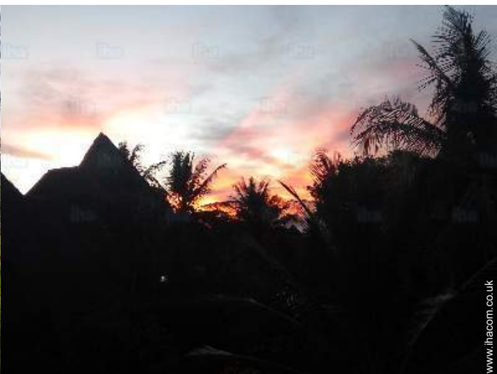
view from the covered terrace