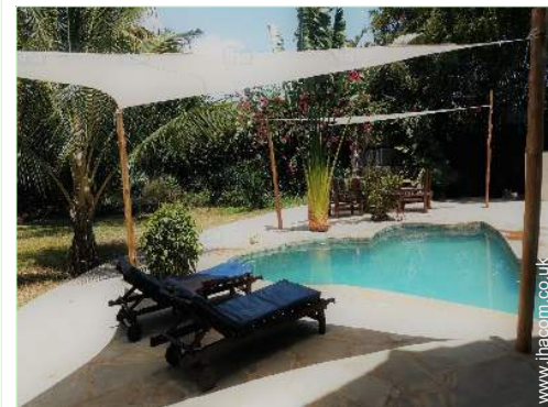
view from the swimming pool