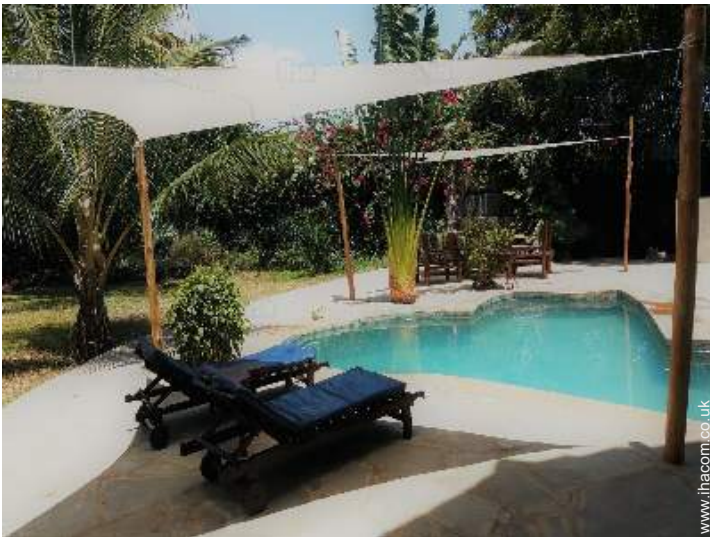
view from the swimming pool