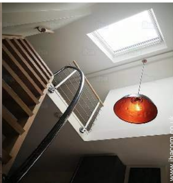
Interior layout and facilities