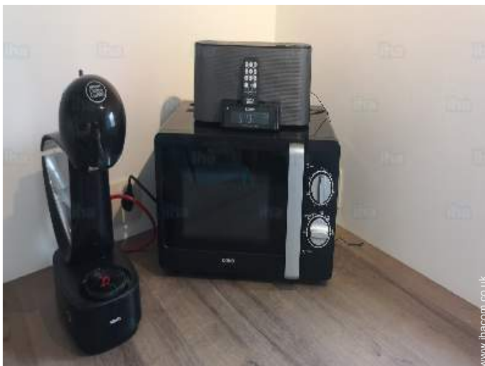
electric coffee maker