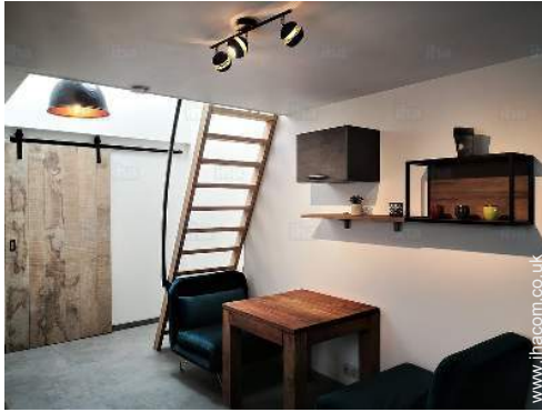
possible extra bed(s)