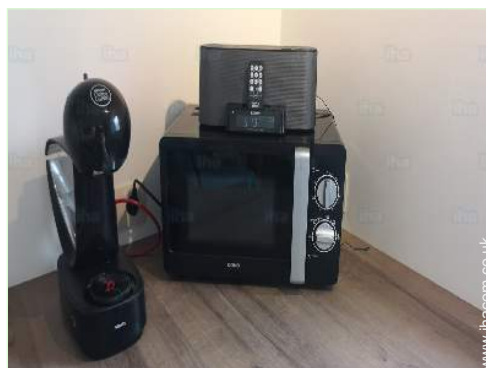
electric coffee maker