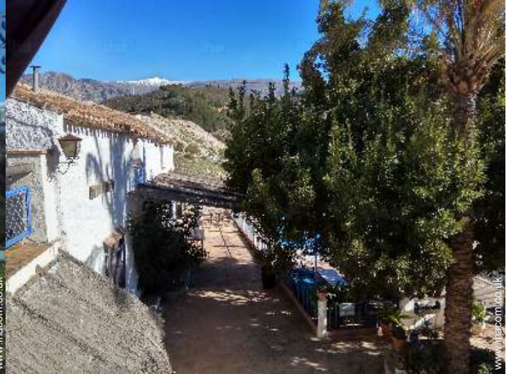
View from the property