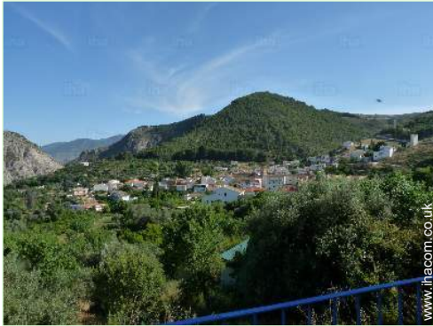
view from the house