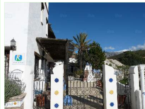
general floor plan