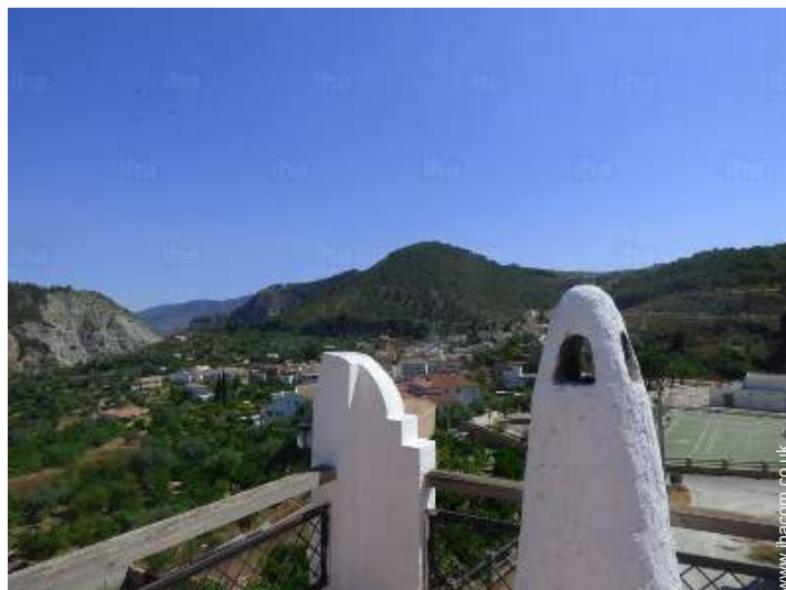
view from the house