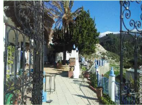
View from the property

BBQ, garden table(s), garden seat(s), parasol, garden seated area, chaise(s) longue(s), sun recliner(s), outside shower facilities