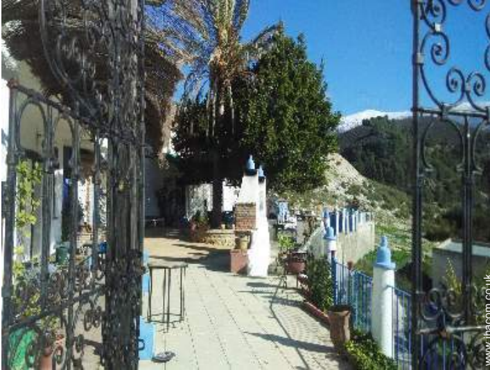
View from the property