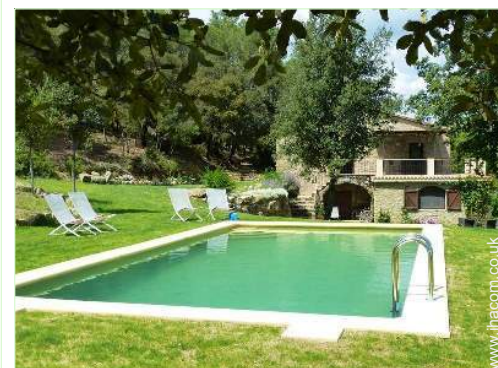
Exterior facilities at guests disposal