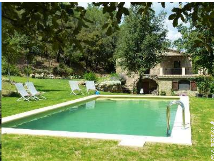
Exterior facilities at guests disposal