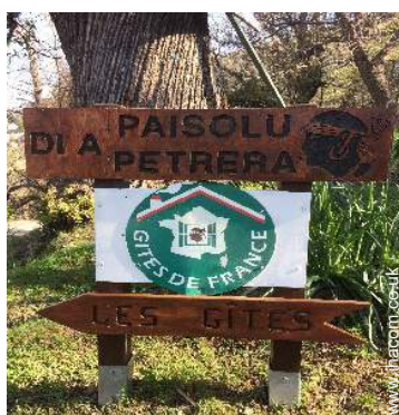
Present on site