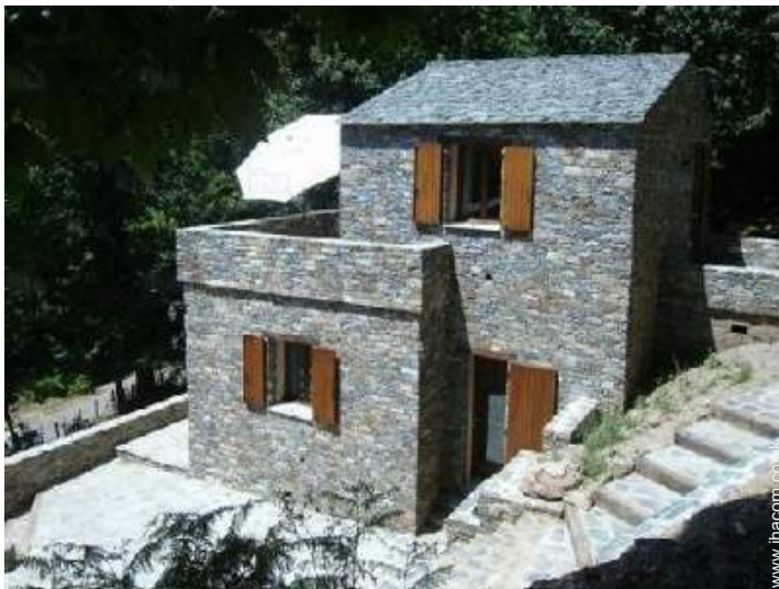
view over the mountain