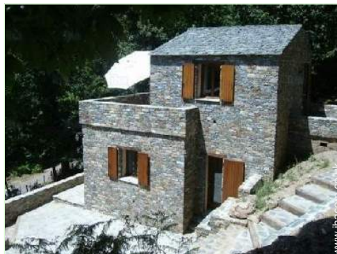
view over the mountain