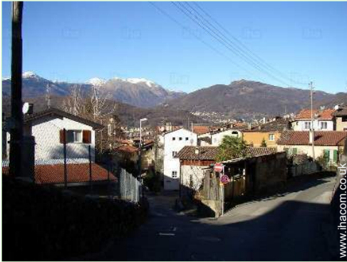
view of the village