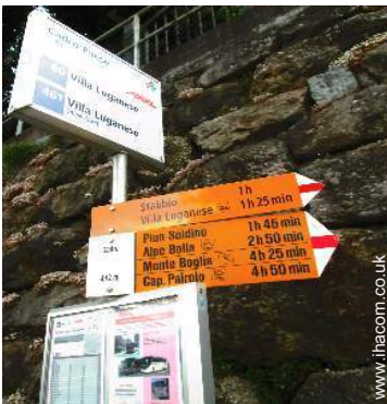
bus stop / bus station