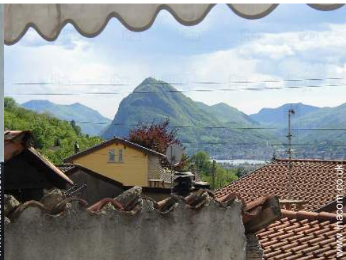
view over the lake