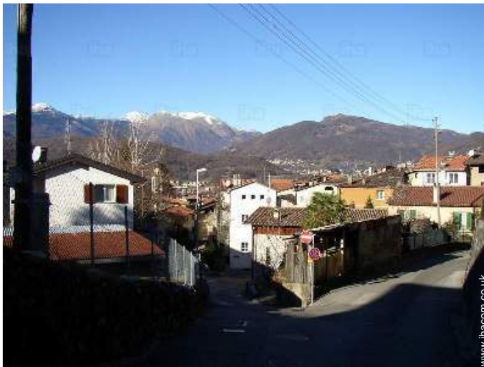
view of the village