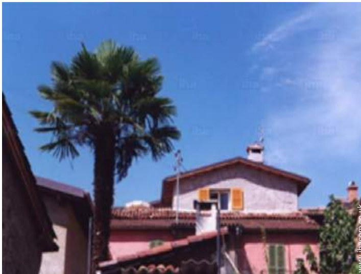
Charming Stone-Built House