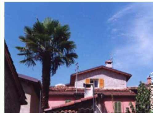
Charming Stone-Built House