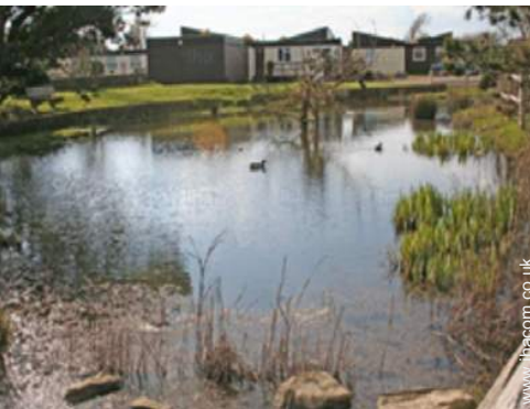
view over the countryside