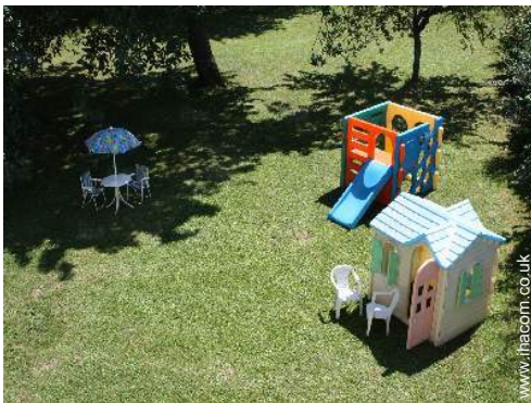
view from the bedroom