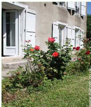
view from the garden/park