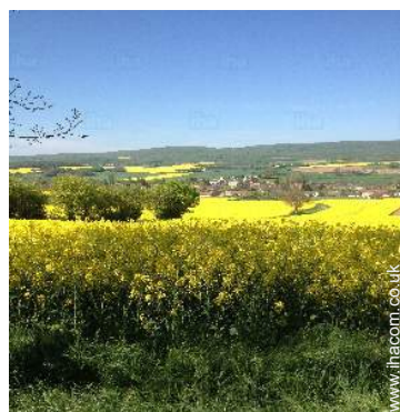
view of the village