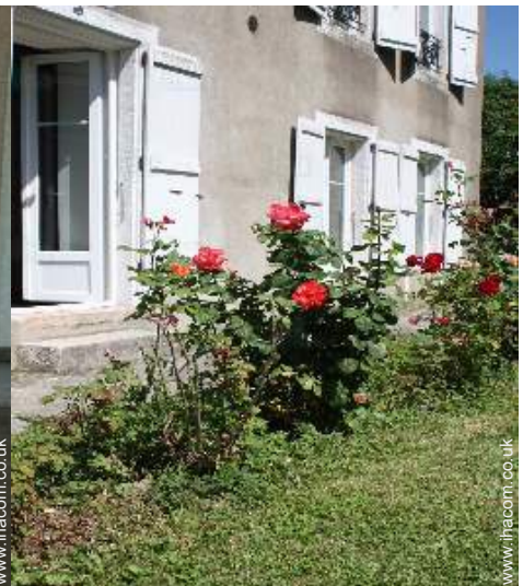
view from the garden/park