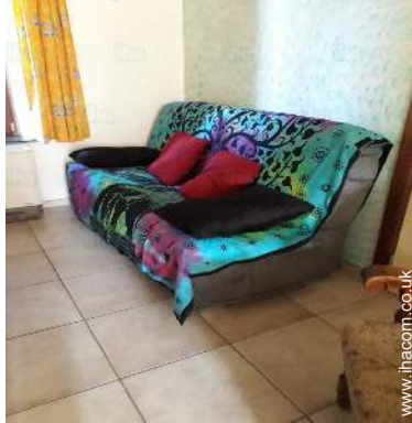
sofa bed(s) 2 pers