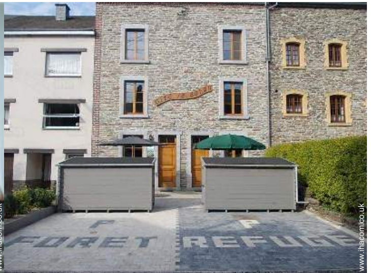
Outside at the guests disposal