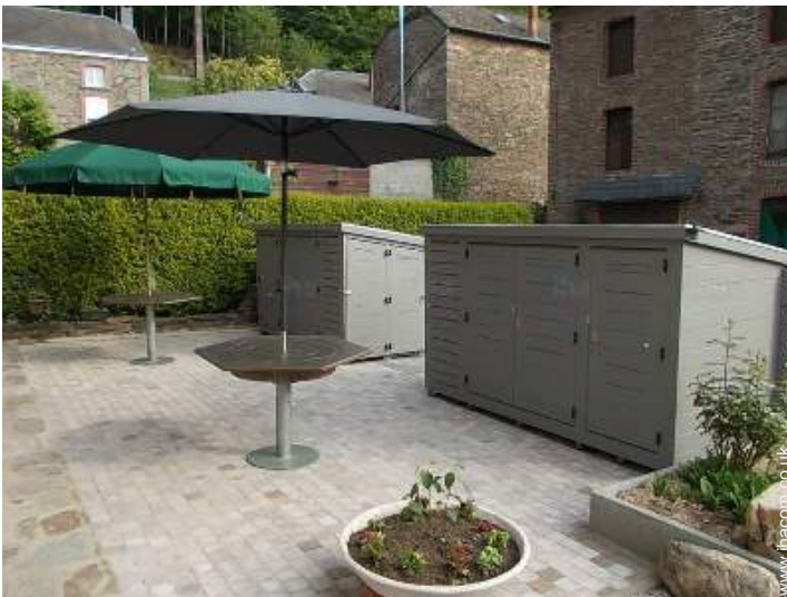
Exterior amenities at guests disposal