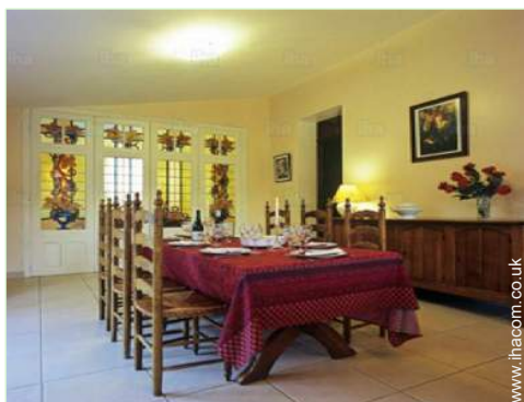
view from the dining-room