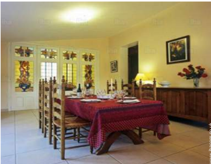
view from the dining-room