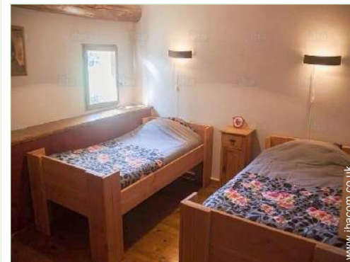
Sleeps - bed(s)

Village centre 3mi. Town centre 3mi. Bus stop / bus station 3mi. Bike/mountain bike hire 3mi. Car rental 3mi. Ski hire shop 15.5mi. Breadshop 3mi. Caterer 3mi. Local shops 3mi. Supermarket 3mi. Hairdressing salon 3mi. Internet cafe 3mi. Post office 3mi. Bank 3mi. Cash point 3mi. Chemist 3mi. Doctor 3mi. Nurse 3mi. Hospital 3mi.