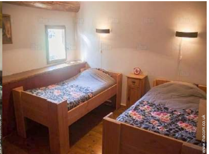
Sleeps - bed(s)