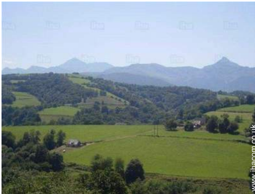
view over the mountain