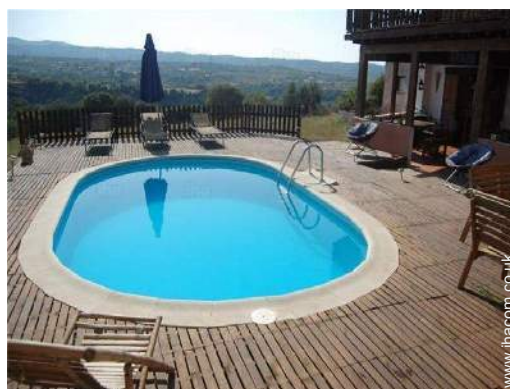
Oval swimming pool