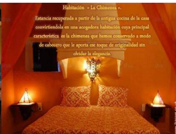
Habitación « La Chimenea ».

Estancia recuperada a partir de la antigua cocina de la casa convirtiéndola en una acogedora habitación cuya principal característica es la chimenea que hemos conservado a modo de cabecero que le aporta ese toque de originalidad sin olvidar la elegancia.