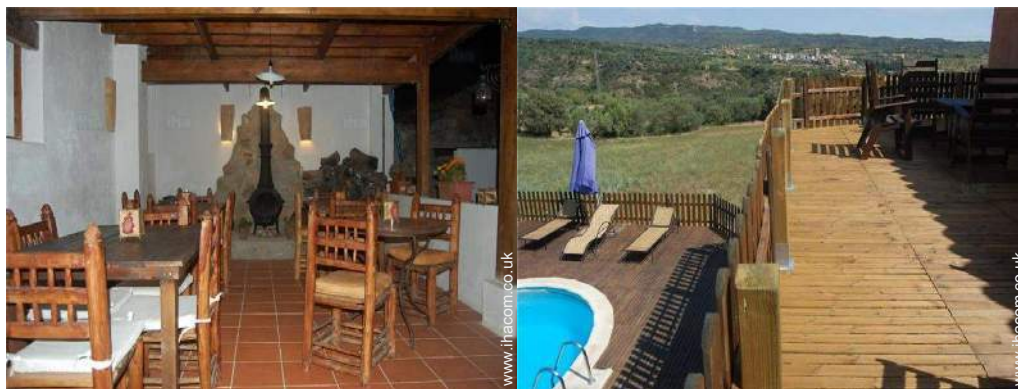
view from the covered terrace