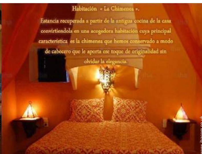
Habitación « La Chimenea ».

Estancia recuperada a partir de la antigua cocina de la casa convirtiéndola en una acogedora habitación cuya principal característica es la chimenea que hemos conservado a modo de cabecero que le aporta ese toque de originalidad sin olvidar la elegancia.