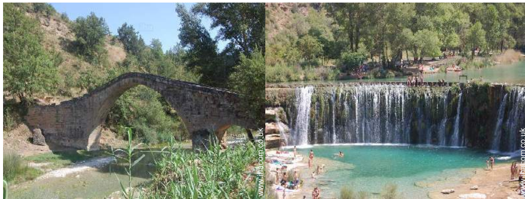
Attractions and relaxation