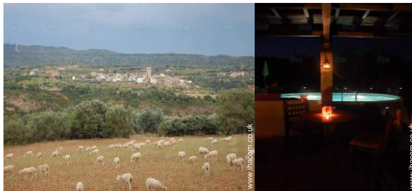
view from the swimming pool