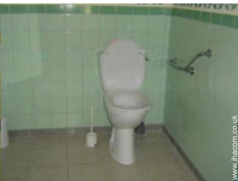
Interior layout and facilities