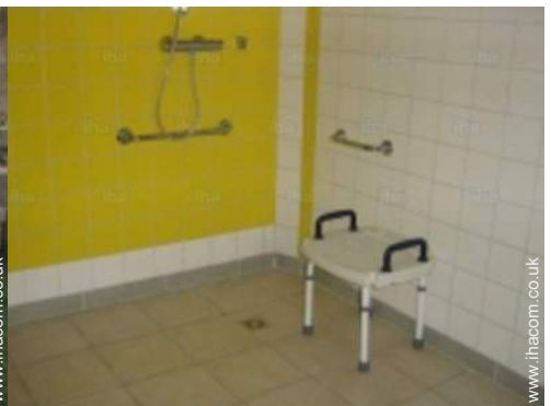
Interior layout and facilities