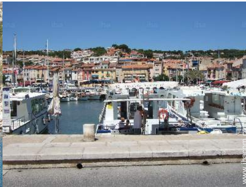
summer sports nearby