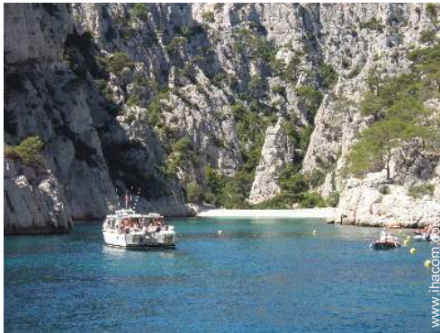
summer sports nearby