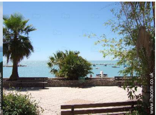
summer sports nearby