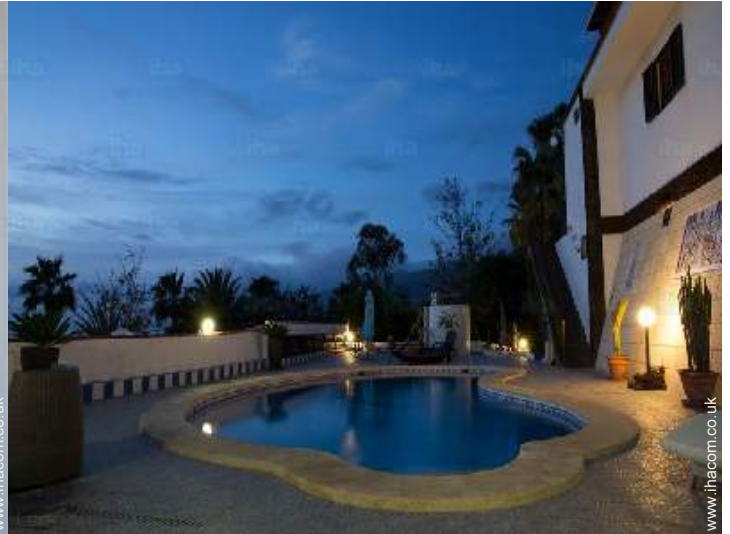
Original swimming pool