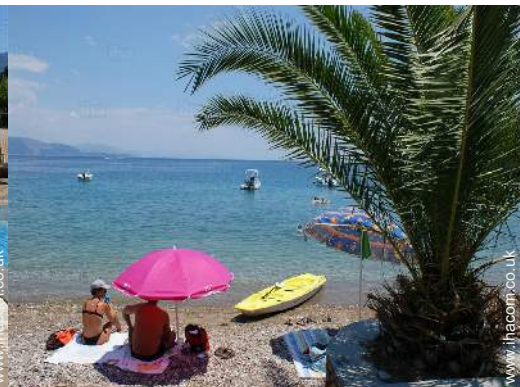
leisure pursuits nearby