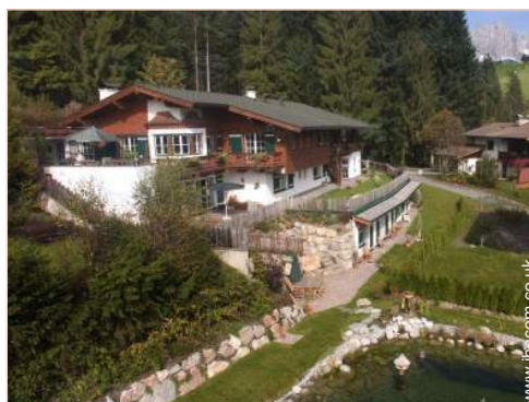
Luxury Country House