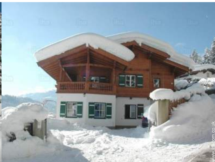
Luxury Country House