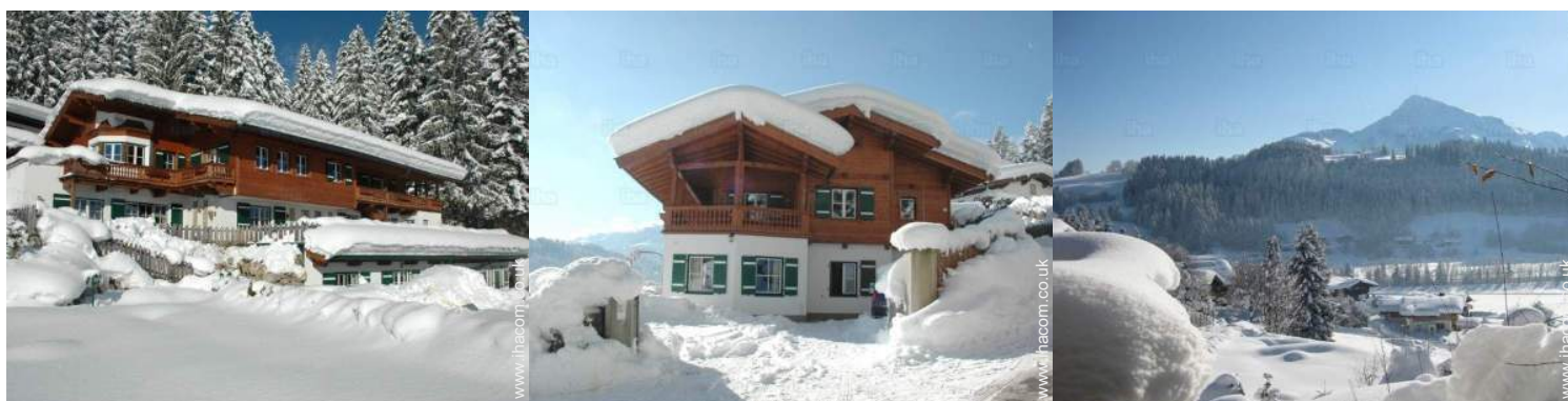
Luxury Country House