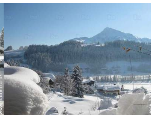
Luxury Country House