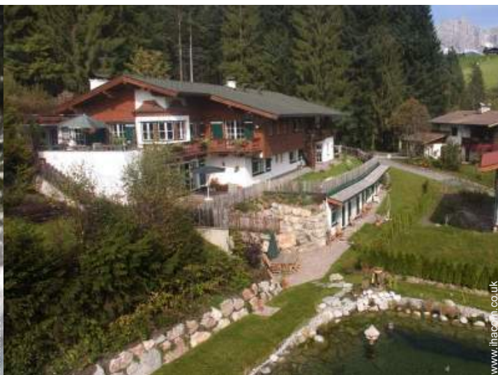
Luxury Country House