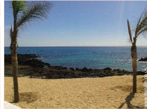
Sea water swimming pool