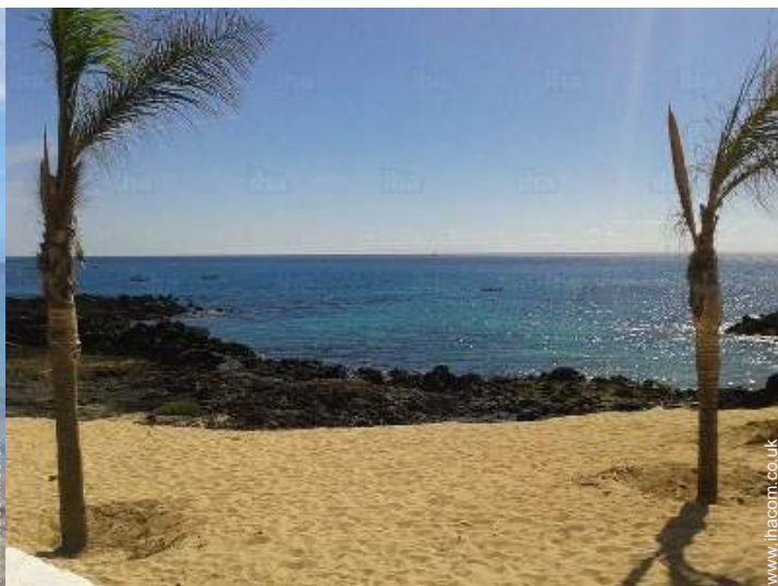
Sea water swimming pool