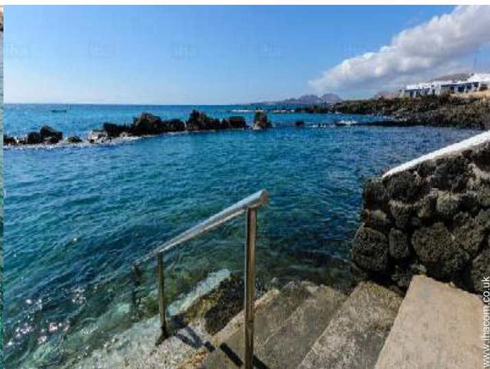
Sea water swimming pool