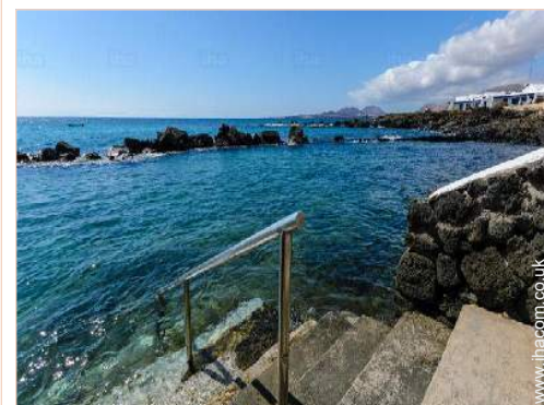
Sea water swimming pool