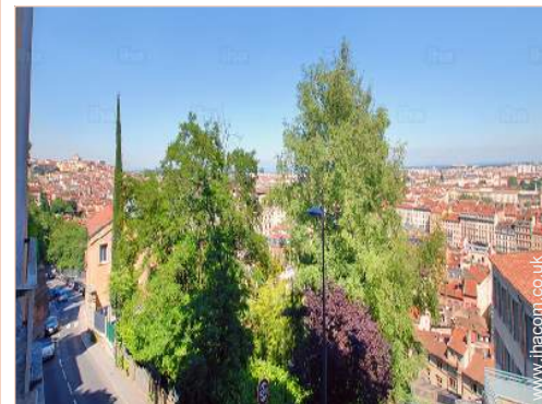
view from the flat