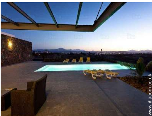
view from the dining-room