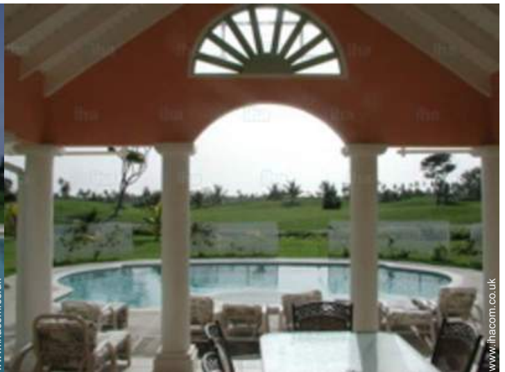
view from the patio