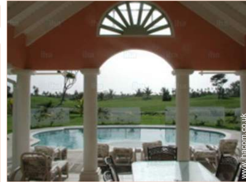
view from the patio