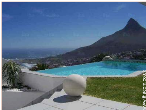
view from the patio