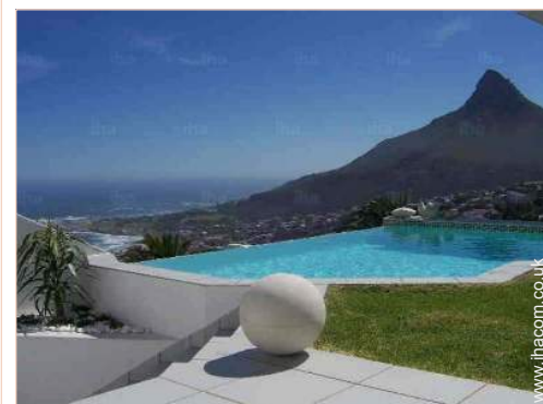
view from the patio