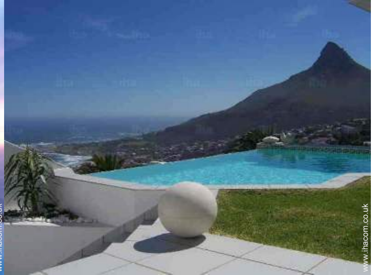
view from the patio