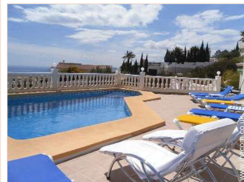
Original swimming pool

Village centre 2.5mi. Town centre 3mi. Bus stop / bus station 3mi. Breadshop Local shops Supermarket Hairdressing salon Post office Bank Cash point 1.85mi. Chemist Doctor Nurse Hospital