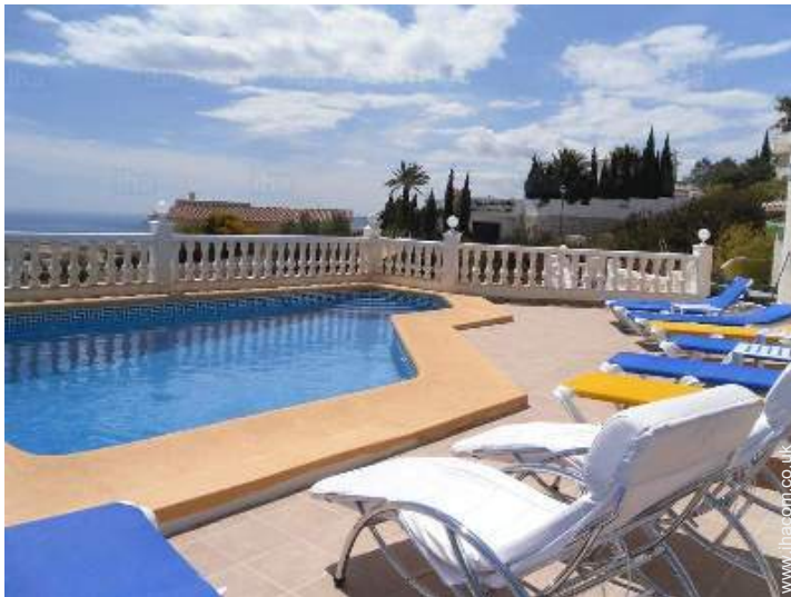
Original swimming pool